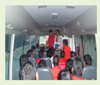
QZS – Enma Mall